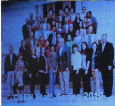
C&EM Staff, Spring 2010